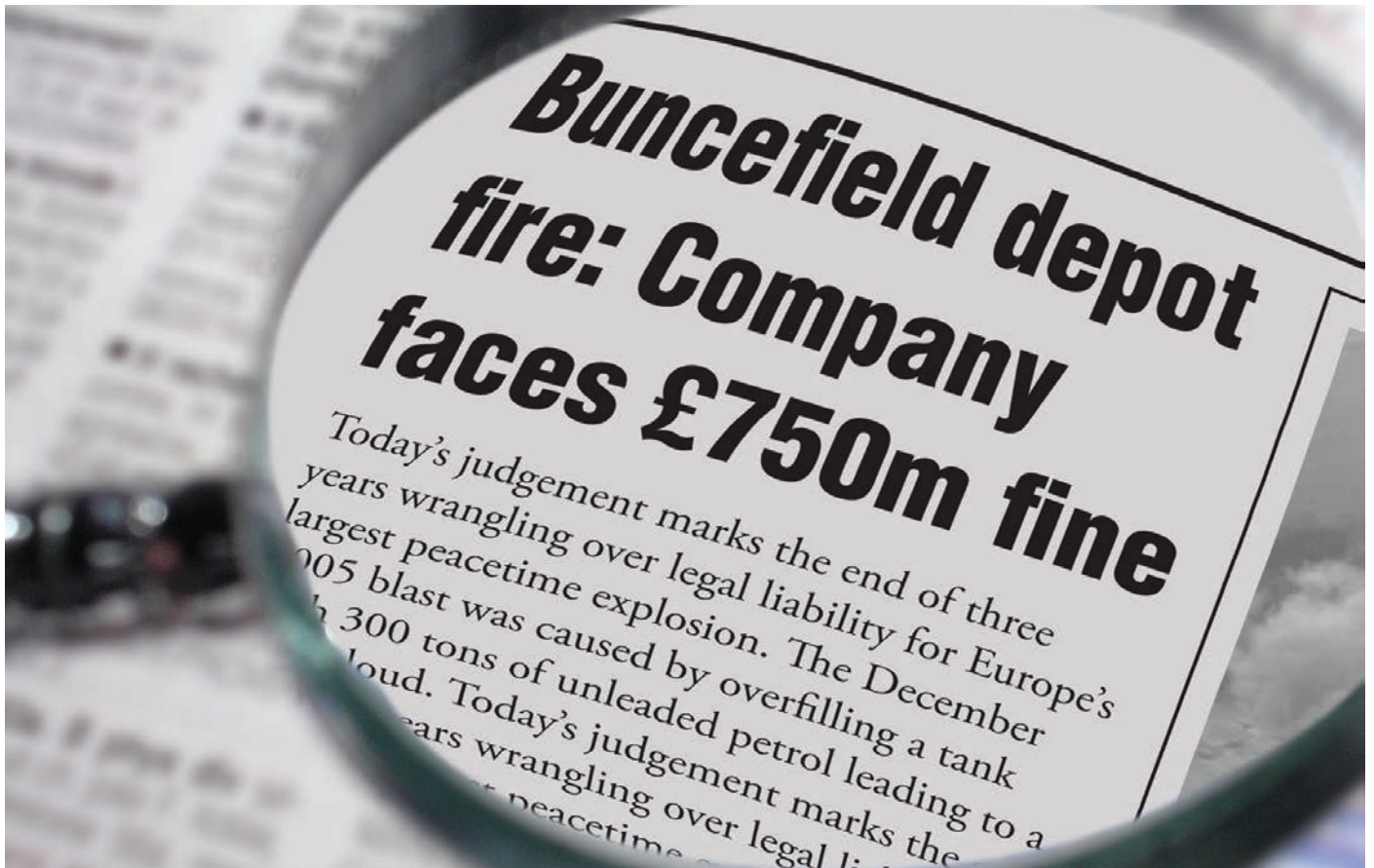
Liquid hydrocarbon leaks can jeopardize safety and damage the environment—both of which can be costly to your reputation and business.